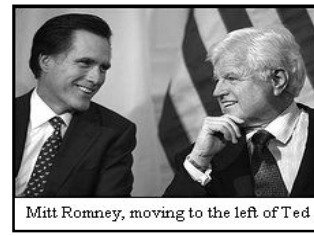
Mitt Romney, moving to the left of Ted